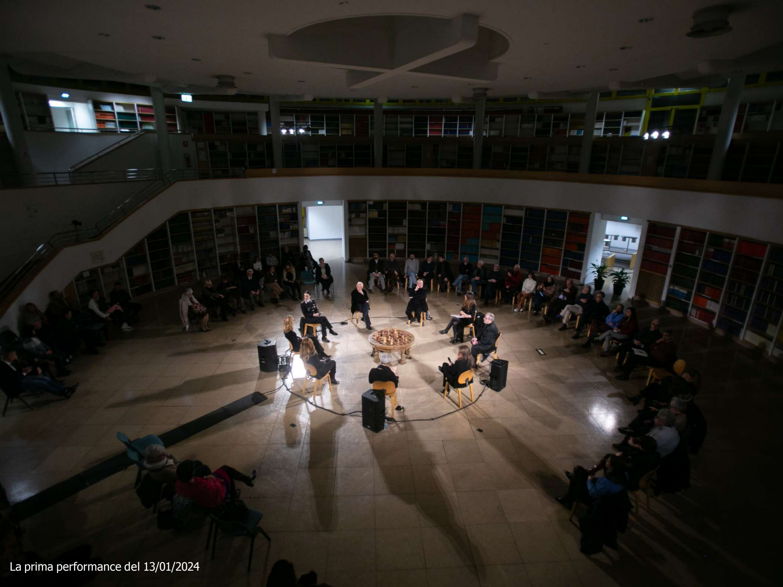
La prima performance del 13/01/2024