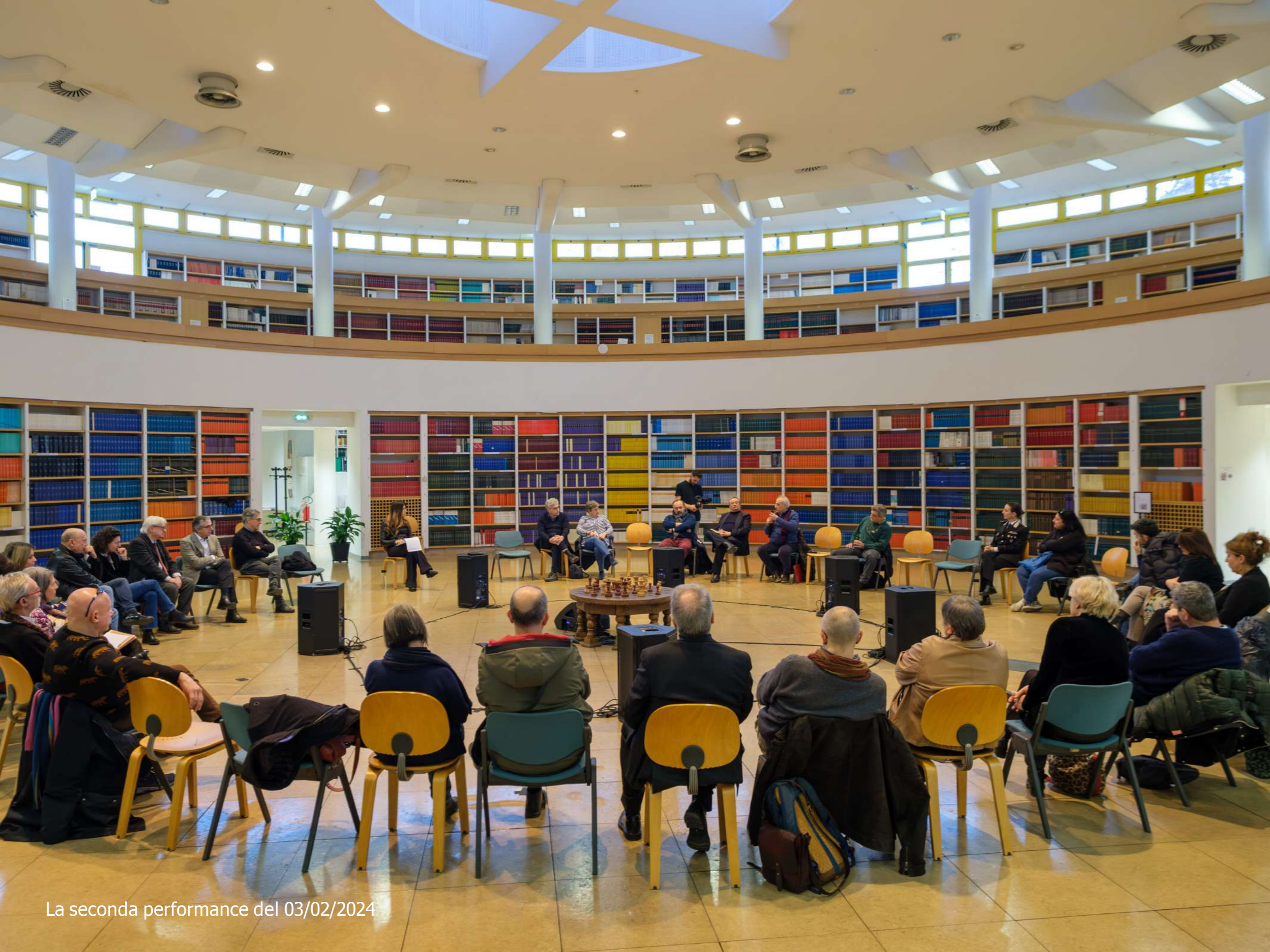
La seconda performance del 03/02/2024